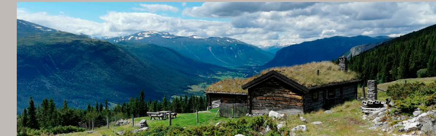
Stavåsen, a hill that's said to have been visited by St. Olav, with a view to the west towards Skjåk.

back down go through a gate, take Hovsvengen past the residential area and you should be back on Solsidevegen, the same road you took on your way up.