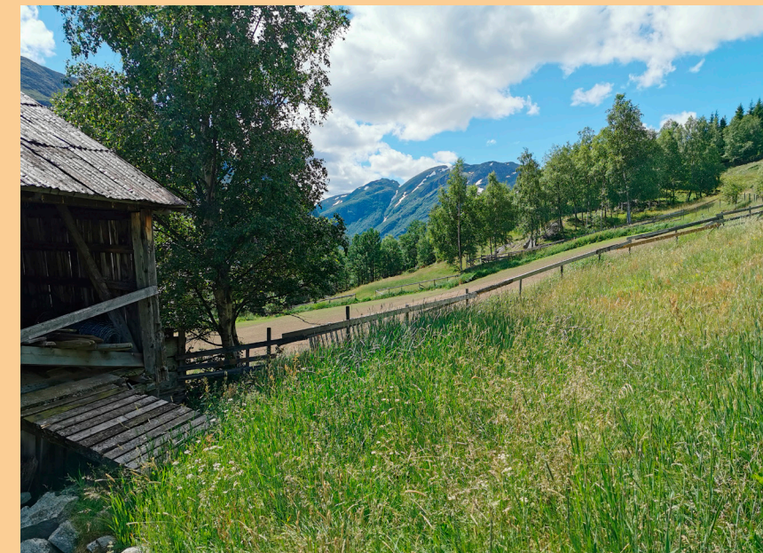
From Slettom towards Bord, the source of Bordvassvegen.

Tip! Walk through the Rural Museum on your way to Bordvassvegen. Here you'll find 22 listed buildings.