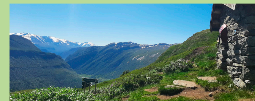
Smithhytta, a cabin located just above the treeline on the way up to Lomseggen from the south.

This trail goes down a small ravine and past the viewpoint Kvilarsteinen. Head down some steep areas near the tree line then follow a forest road a few hundred meters before continuing on a trail down through the forest. When you are almost